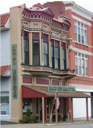
The new look of Hammons Realty Co. is really sharp! Thanks, Phil, for investing in your community by sprucing up your building!