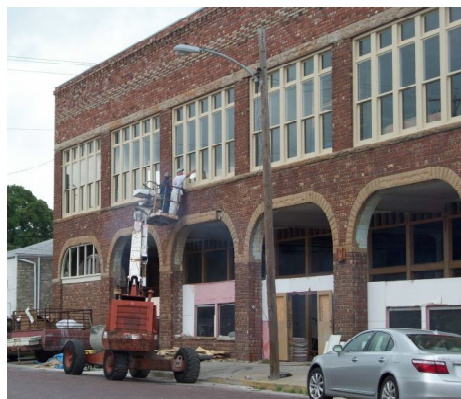
Dean and Becky Mann continue the process of renovation on their downtown building. An event facility, restaurant space and retail space are planned for the building.